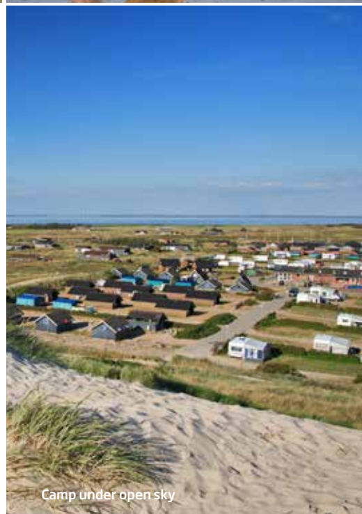
Camp under open sky

The Nordsø Express daily (except Saturday)