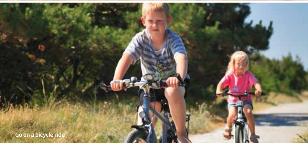
Go on a bicycle ride